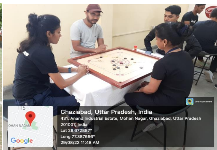
Students playing Kho-Kho and Carrom