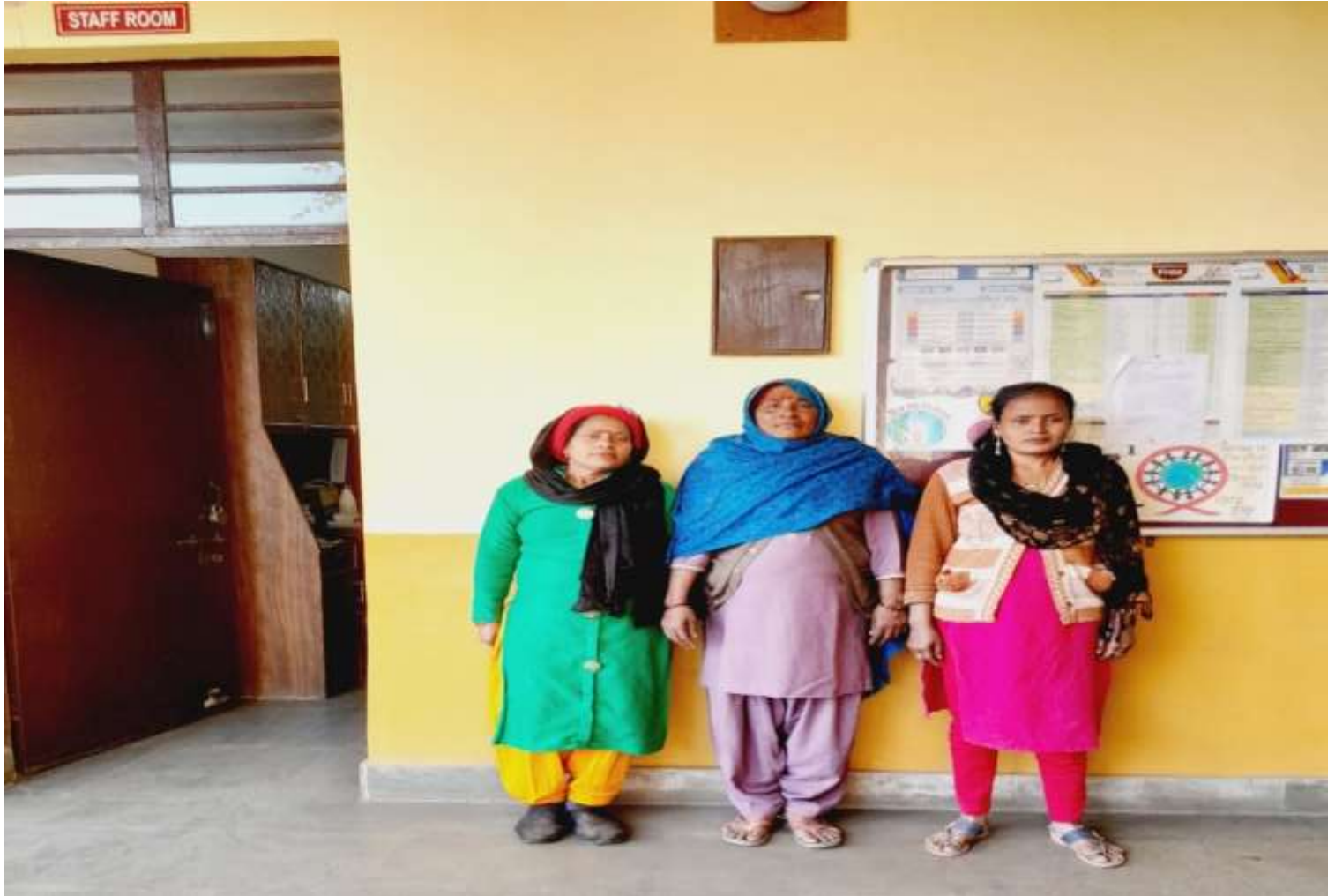
Women housekeeping staff of Modern College of Professional Studies

Email : info@moderncollege.org | Website : www.moderncollege.org