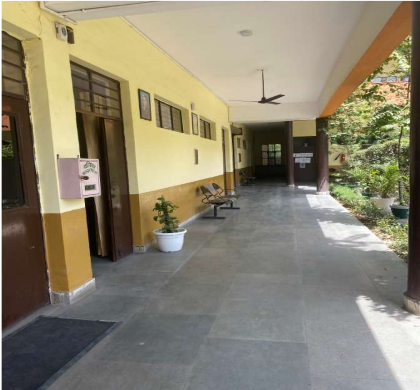
Girls Complaint Box