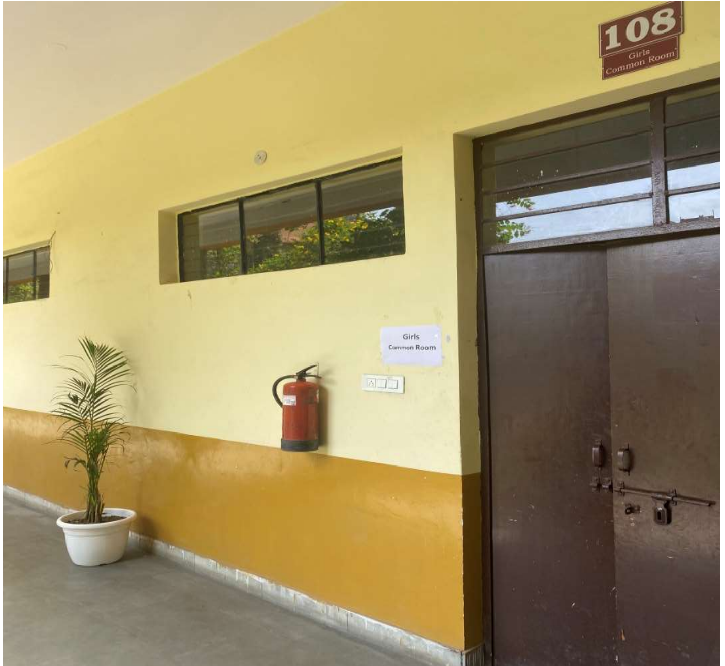
Separate Girls Common room

Email : info@moderncollege.org | Website : www.moderncollege.org